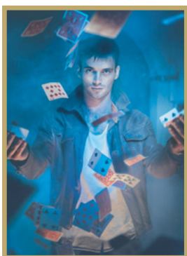
Illusionist Artyom Kox

https://www.youtube.com/watch?v=kektifV2mNg